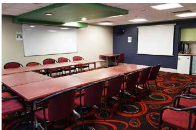
^ Downstairs Meeting Room