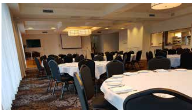
^ Fairways Room 2