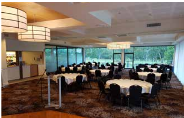
^ Fairways Function Room